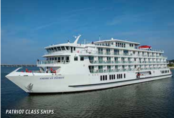
PATRIOT CLASS SHIPS